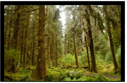
Point of View